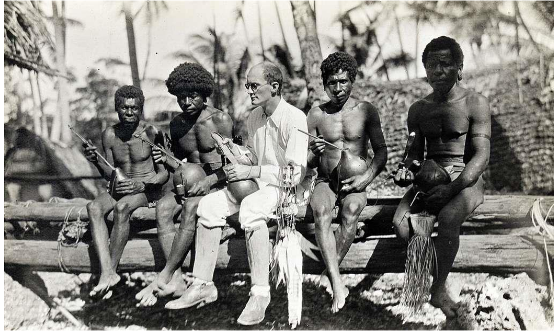
Malinowski in the Trobriand Islands, 1910.