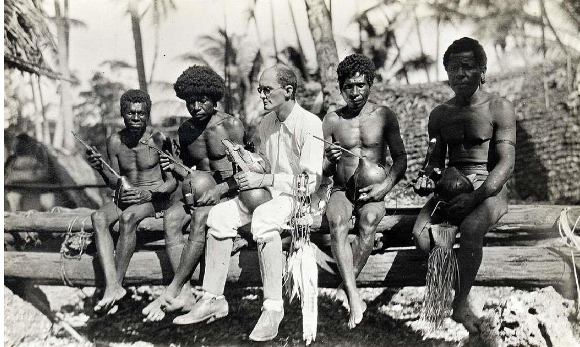
Malinowski in the Trobriand Islands, 1910.