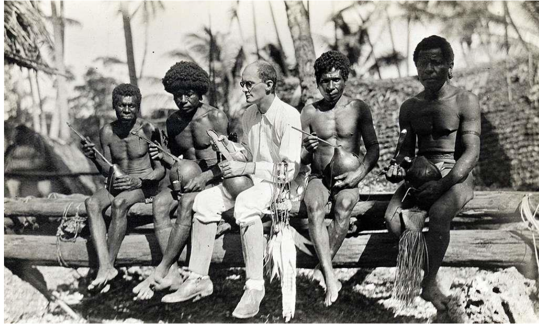
Malinowski in the Trobriand Islands, 1910.

Possibly éthnos comes from the ancient Greek root éthōs , first the place with a group lives together, and then, acquired habit or custom. Éthnos in ancient Greek means a "group, crowd, nation or people" that lives together and have certain habits. An appropriate term to account for the socially constructed diversity of ways of being human